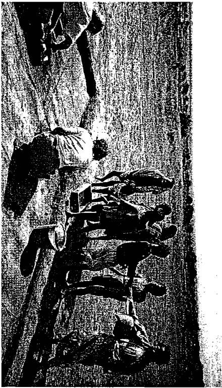
Figure 12.3 Children of the village of Montefeno took part in excavations in 2000 on this seventeenth-century royal village site. They were particularly talented at identifying species and parts of animal bones.