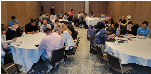
Figure 3: In-class experiment for this course at CHI 2023 in Hamburg.