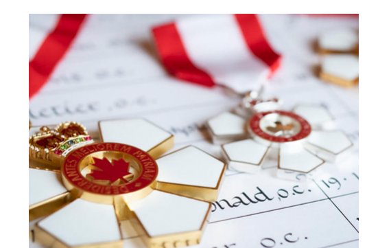
Three alumni named to the Order of Canada

The alumni were among six individuals with York connections to receive Canada's highest honour, recognizing those whose extraordinary contributions, achievements and innovations have made a positive impact on communities throughout the