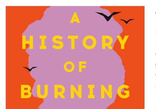
Enjoy books related to lifelong

distinguished York students with 2024 alumni awards and scholarships for their academic excellence and leadership. Read more. Join our alumni book club