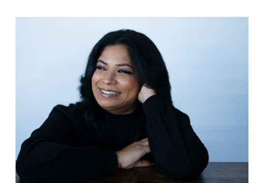
Submit your story for