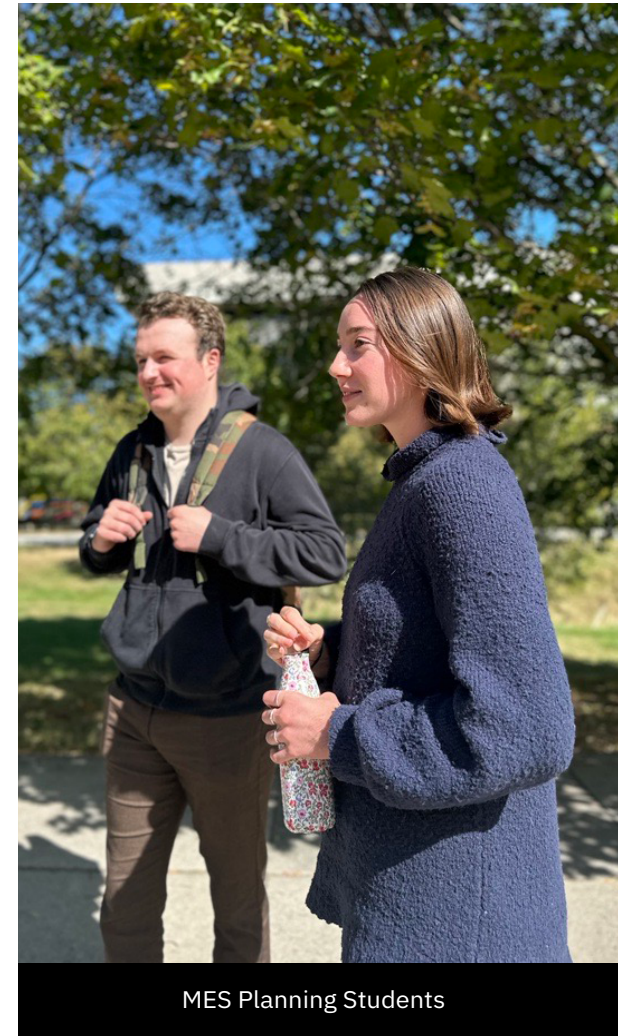
MES Planning Students

Scan the QR Code for the complete details on the MES Planning Program.