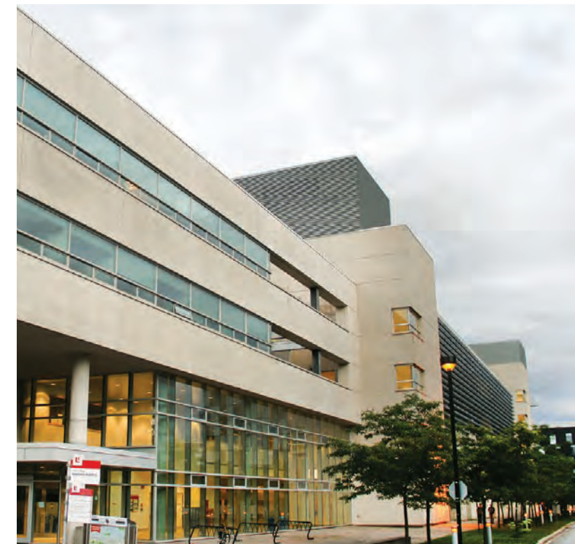
The Victor Phillip Dahdaleh Building, home to the Dahdaleh Institute for Global Health Research.