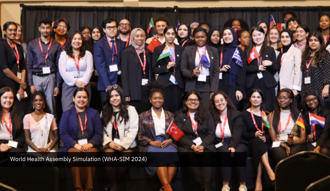
World Health Assembly Simulation (WHA-SIM 2024)