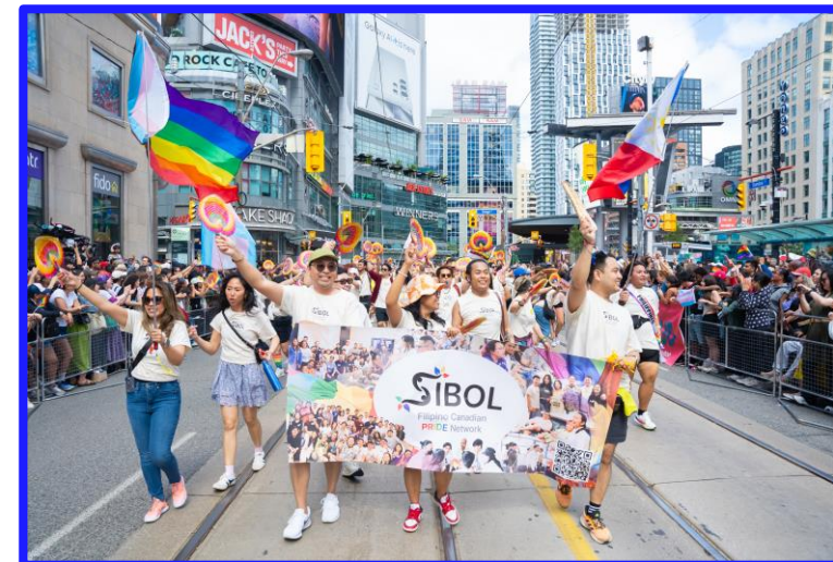
SIBOL Pride Network at the Pride Parade 2024