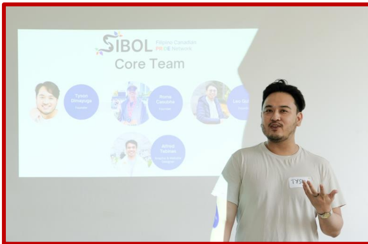
The launch of SIBOL Pride Network in 2023

I am deeply honoured to have been awarded the 2024 Dr. Kenneth McBey Graduate Fellowship in Management . This prestigious award recognizes a master's student who demonstrates outstanding voluntary services to Canada and the community.