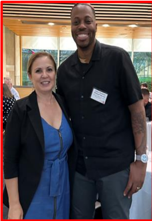
Dr. Jason "Kardinal Offishall" Harrow Thank you! York Hon. Doc 2024

Congratulations to our June 2024 SPPA Grads!