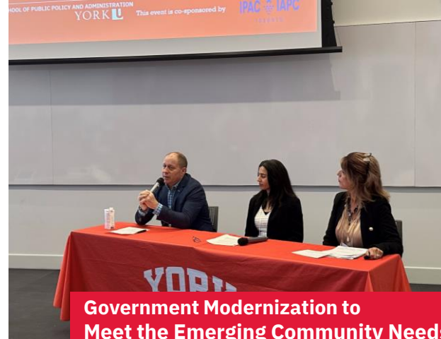
Government Modernization to Meet the Emerging Community Needs