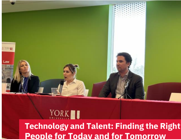
Technology and Talent: Finding the Right People for Today and for Tomorrow