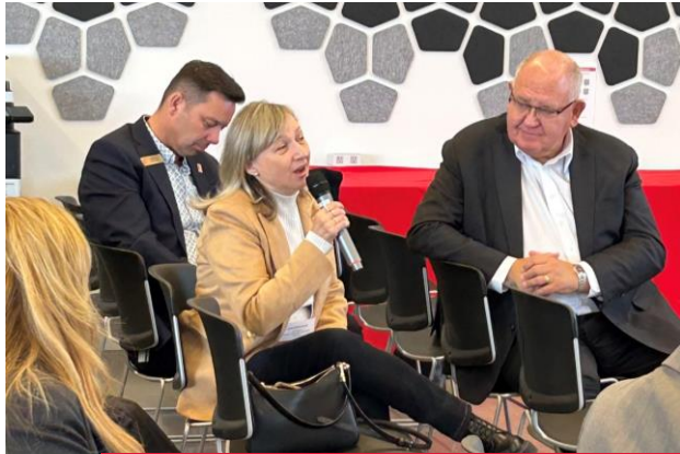
Panel Discussion Q&A