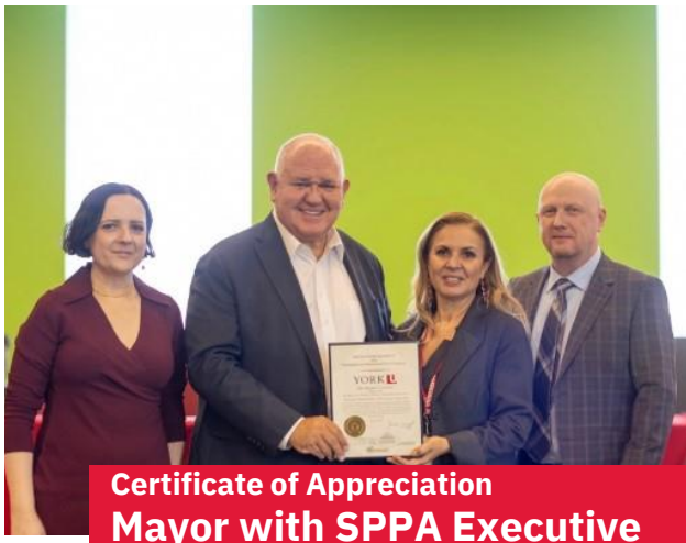
Certificate of Appreciation Mayor with SPPA Executive