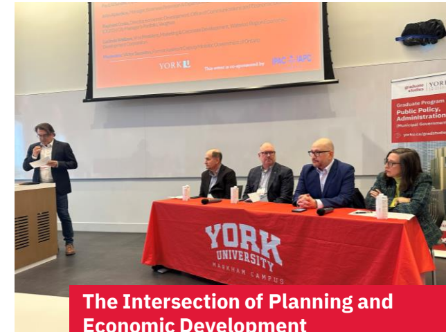
The Intersection of Planning and Economic Development