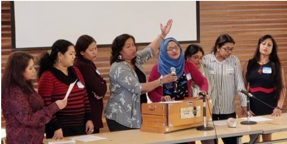
Members of SAWRO singing Amar Protibader Bhasha (The Language of my Resistance) at the November 2nd community forum for Promoting Migrant Collective Action