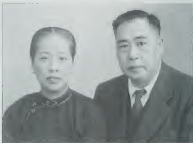
My parents in their sixties