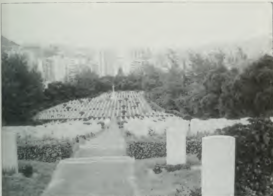
Sai Wan War Cemetery (Hong Kong)