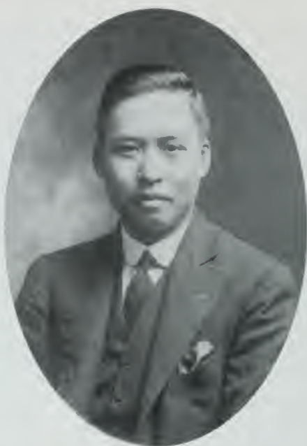
My father, the Inspector of Vernacular Schools, 1920s