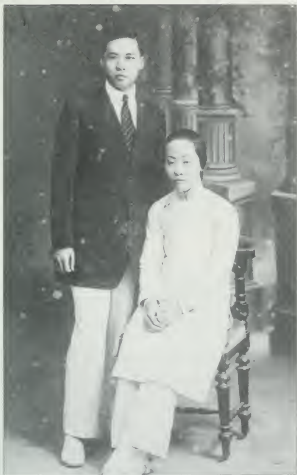
My parents in their early years, 1909-10