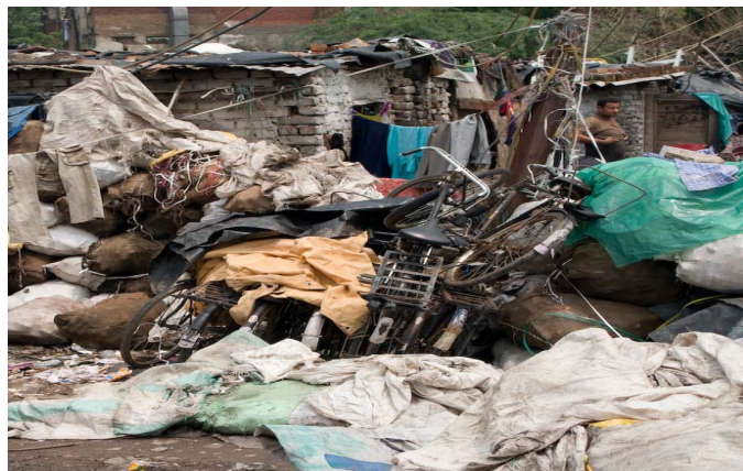
Figure 8: Alley warehouse, Old Delhi

basically a sort of dimly lit one room affair in most instances so it's not much to speak of (see Figure 7). Most of what he stores is spilling out onto the pavement, and he's obviously engaged in some negotiations with the local beat cops, paying them off on the side to let him do that. This is a warehouse owner in Old Delhi who is using an adjacent alley as a public space for assorted items (see Figure 8).