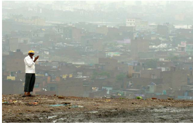
Figure 1: Municipal worker who works on one of Delhi's largest landfills. (Vinay Gidwani 2013)

This gentleman here (see Figure 1) is a municipal worker who works on one of Delhi's largest landfills. He is atop a landfill that I visited in Delhi in August of 2013. It's the highest point on the landscape, and in so many ways echoes what Calvino was talking about.