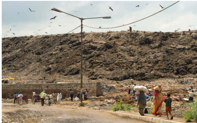
Figure 4: Ghazipur landfill, Delhi's largest municipal dumpsite, an urban commons that supports a diverse community of waste pickers

should point out that a lot of this work that I've been doing on informal waste economies is in conjunction with an advocacy group in Delhi that has been working on this for much longer than I have, an organization called Chintan Environmental Research and Action Group. Our interviews with landfill workers at Ghazipur told us that this was actually a hollow depression about 50 feet below the surrounding area when it was first started in 1984, which has grown to 500 feet above in the intervening years. This landfill, like many other segments of the city, supports a livelihood ecology. You can think of it as a kind of small urban ecosystem.