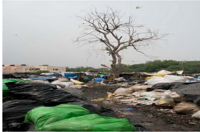
Figure 9: Squatter settlement that doubles up as storage

I'm not going to spend much time talking about judicial activism in Delhi that has been quite consequential particularly in the past 15 years in transforming the spatial economics of these informal economies around waste. However, it is notable that the various judicial decisions that have been handed down in the past 15 years have had an enormous impact on the viability of many of these informal economies. They include decisions that have essentially opened up the recycling of waste to corporate entities so the municipal governments of cities like Delhi have now started contracting waste management to corporations, with profound effects on these waste economies. It's an era of judicial activism that the legal scholar Usha Ramanathan has described as a scenario where what was once informal has now become illegal.