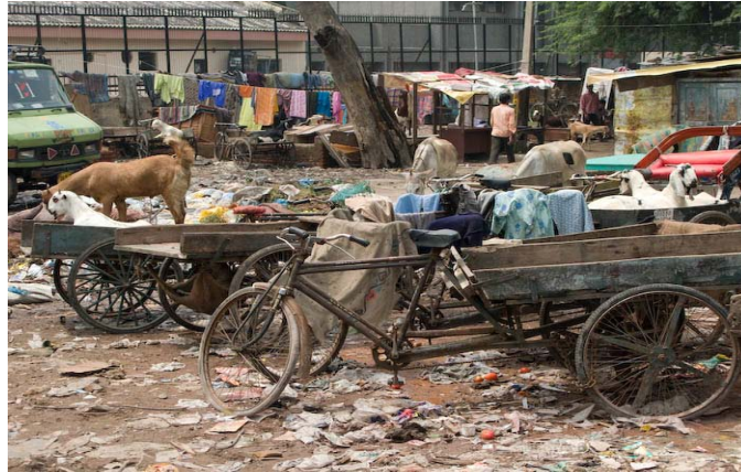
Figure 5: An empty cycle cart

Volume also matters, because there are scale economies in transportation. If you're able to gather up sufficient quantities of waste, which can all then be transported in one go in an overloaded truck, then the warehouse owner is likely to give you a better price. Timing also matters, and here's where the capacity to store becomes so critical, because if you can't store you have to sell at the reigning price. If you can store, you can play the market, because the market also fluctuates, the price fluctuates. Until recently the country that has been exerting this giant sucking sound is China: China is the biggest consumer of scrap, of cardboard, of metals, of plastics, of glass, of e-waste and so on. So, what happens in China has ripple effects in Delhi. This is an example of how, if you have a simple technology like a cart that you can join to your cycle, then it suddenly increases both the catchment area and the volume that you are able to gather. This is what an empty cart looks like (see Figure 5). These are waste pickers who are sorting their wares on a waterlogged tract near the banks of the Yamuna River that flows through Delhi, because it's so hard to find a place to sort (see Figure 6). This is the humble shop of a scrap dealer,